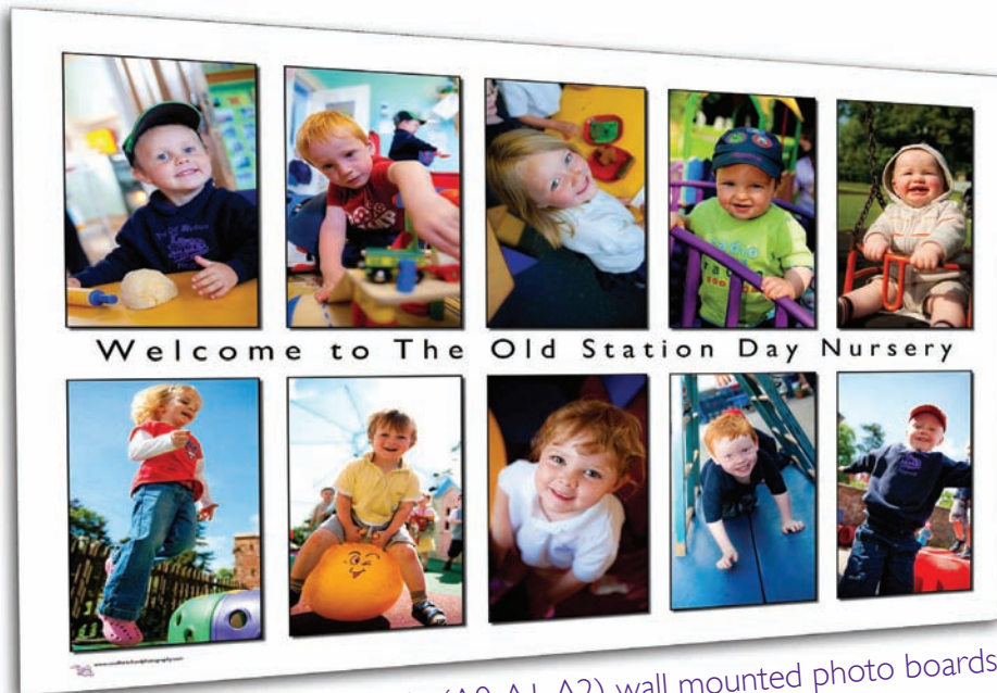
Large scale (A0,A1,A2) wall mounted photo boards