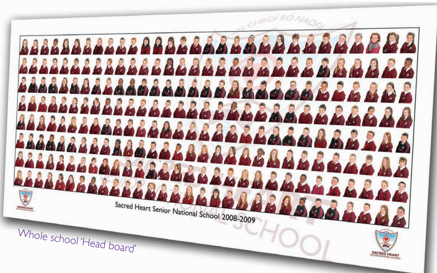
Whole school 'Head board'